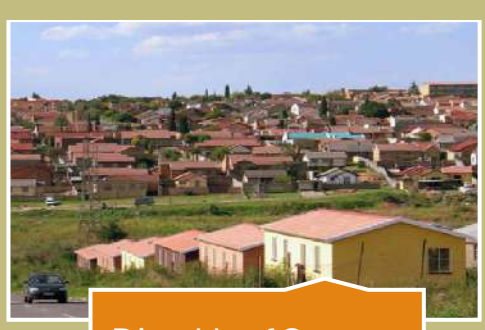
Diep kloof Soweto

The Apartheid Museum is our next stop where we get a true and final depiction on the magnitude of the Apartheid regime and the role Nelson Mandela, and his peers played in overcoming it. The Apartheid Museum was opened in November 2001. It is part of the Gold Reef City complex. Apartheid Museum Tours illustrates the rise and fall of apartheid. The Apartheid Museum Tour shows how South Africa was before apartheid ended in 1994. The Museum has about 22 exhibitions with each highlighting the various struggles during the Apartheid era. The Exhibitions include the Nelson Mandela Release and the Mandela Presidency amongst the others.