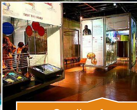
Cradle of Humankind