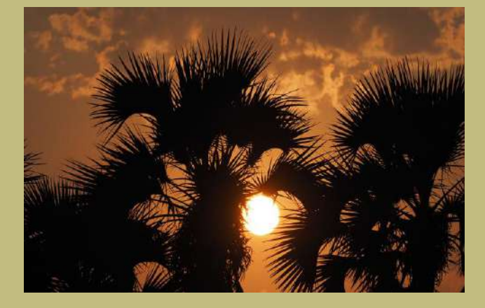
<u>Day 3:Kruger National Park to</u> <u>Johannesburg</u>